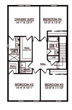
NITTANY STARTING AT 2081 SF