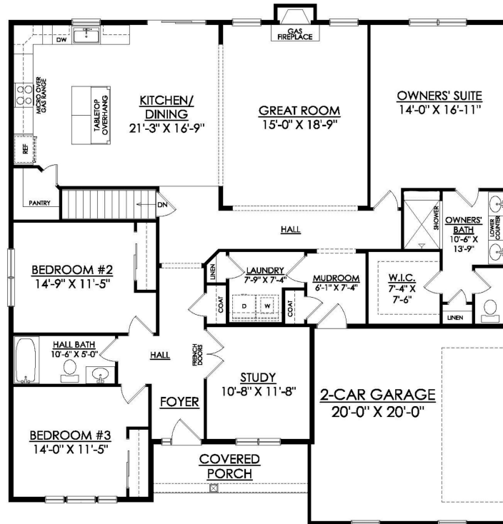
FOLINO CRAFTSMAN RIVERVIEW ESTATES STARTING AT 3134 SF