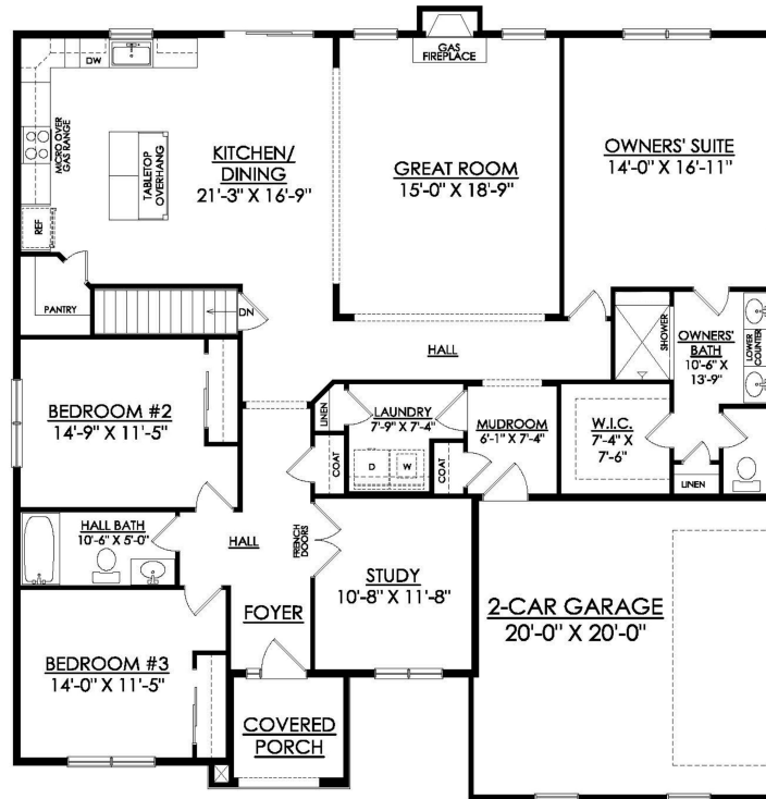
FOLINO COTTAGE RIVERVIEW ESTATES STARTING AT 3134 SF