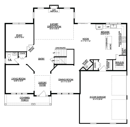
JUNIPER FARMHOUSE 1ST FLOOR PLAN