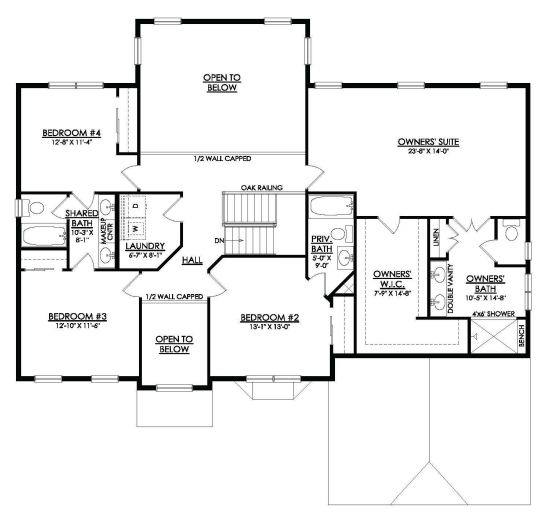
JUNIPER TRADITIONAL 2ND FLOOR PLAN