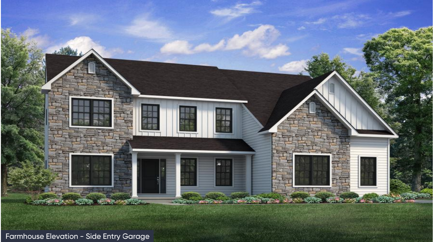
Farmhouse Elevation - Side Entry Garage

Discover the perfect family home in The Churchill! This beauty offers over 3000 sq ft of living space of elegance and comfort. The 2-story Great Room sets the tone of this open-concept floorplan, while the living room provides a warm and inviting space for gatherings. The gourmet Kitchen, complete with Dining Nook leading to the backyard, is a chef's dream with ample countertop space and a large island with room for seating. A formal dining room and study complete the main level. The second floor boasts a luxurious Owner's Suite with private Bath. Three additional Bedrooms, a shared hall Bath, and a conveniently located 2nd floor Laundry Room can also be found upstairs. Some images, videos, virtual tours shown may be from a previously built Tuskes home of similar design. Actual options ... Read More at tuskeshomes.com