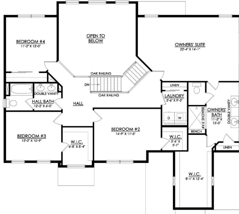
CHURCHILL TRADITIONAL STARTING AT 3110 SF ESTATES AT SAUCON VALLEY

In Estates at Saucon Valley from $843,900