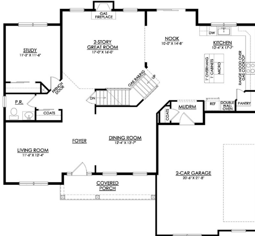
CHURCHILL FARMHOUSE STARTING AT 3060 SF ESTATES AT SAUCON VALLEY

In Estates at Saucon Valley from $843,900