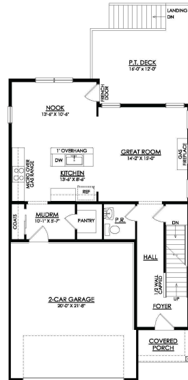
MIA 1ST FLOOR PLAN SS34