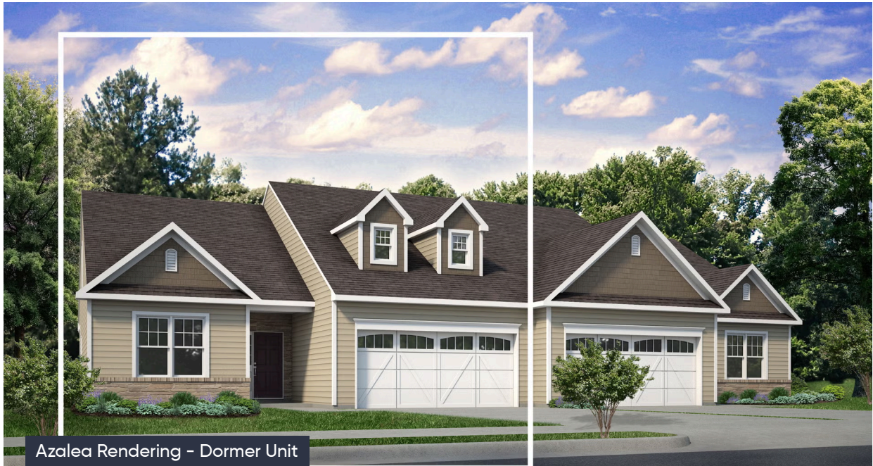
Azalea Rendering - Dormer Unit