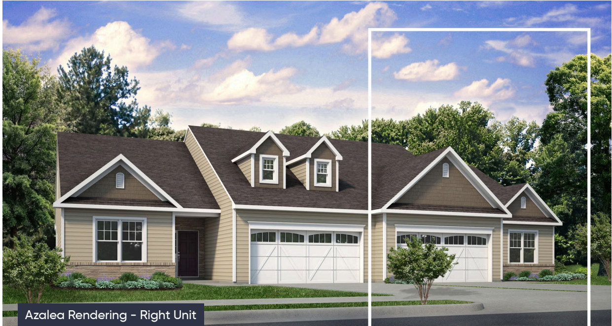
Azalea Rendering - Right Unit