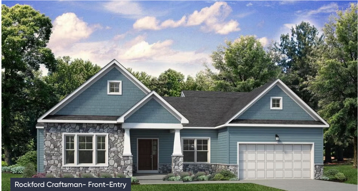
Rockford Craftsman- Front-Entry