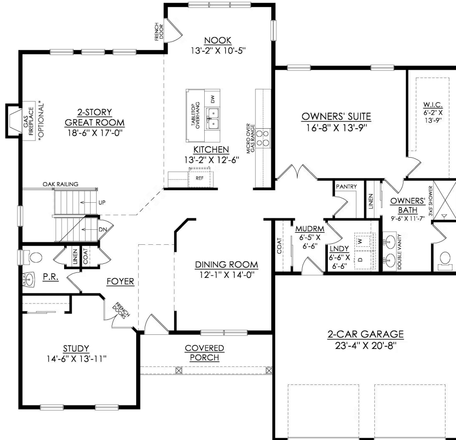
SIENNA COUNTRY STARTING AT 2828 SF