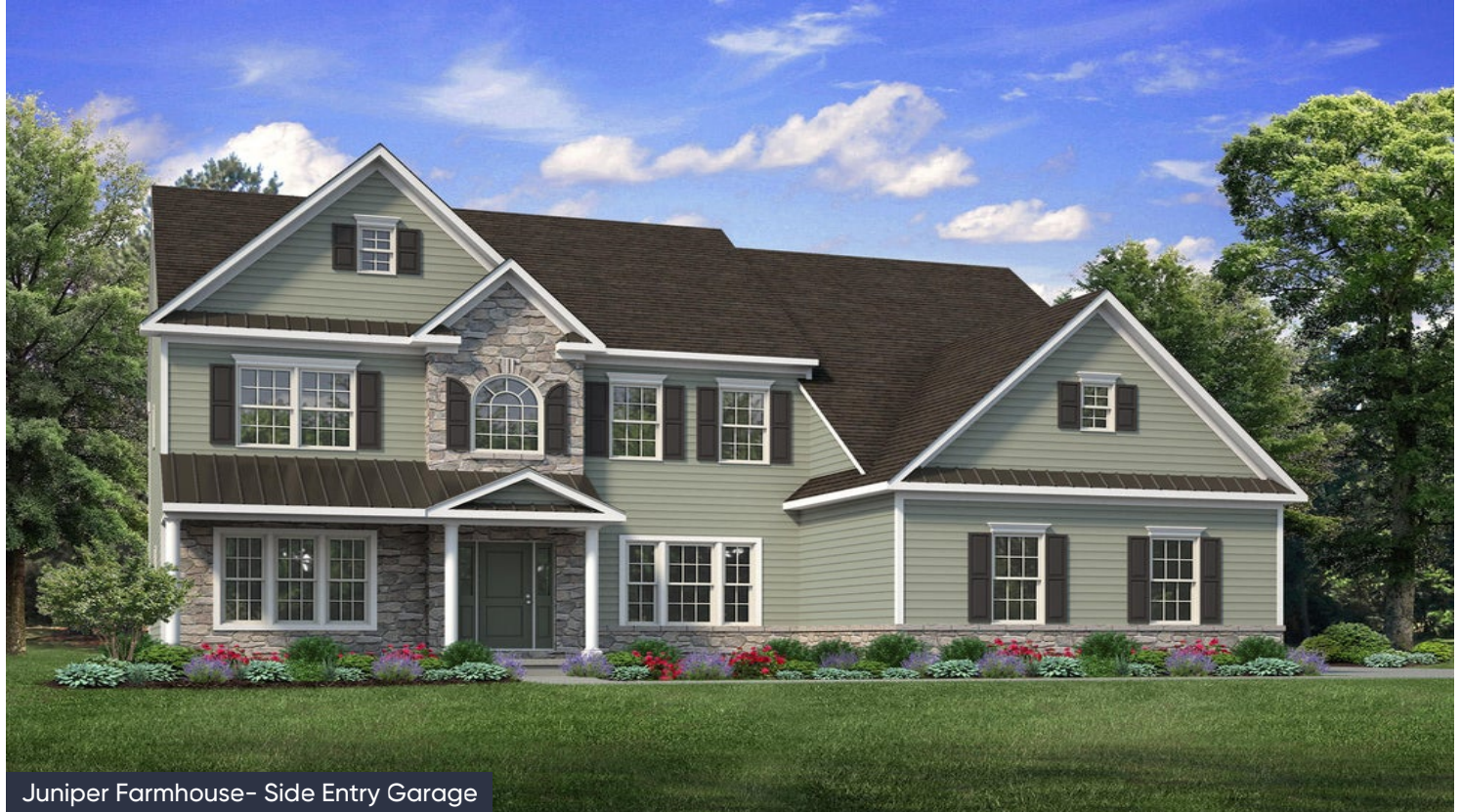
Juniper Farmhouse- Side Entry Garage

Elevate your lifestyle with the Juniper, offering the perfect balance of privacy and comfort for you and your family. An impressive two-story Foyer sets the tone for this home's spacious open-concept main living area. The Kitchen is a cook's dream, with an expanded island, a walk-in pantry, and a butler's pantry for serving drinks or snacks. The airy 2-story Great Room boasts a gas fireplace and plenty of windows for natural light. A private Study and Powder Room complete the 1st floor layout. Head up the open staircase to find an enormous Owner's Suite with sitting area, a walk-in closets, and private Owner's Bath. Additionally, a Guest Suite with its own Bath, two additional Bedrooms that share a Jack-n-Jill bath, and a convenient 2nd floor laundry room can also be found on the 2nd ... Read More at tuskeshomes.com