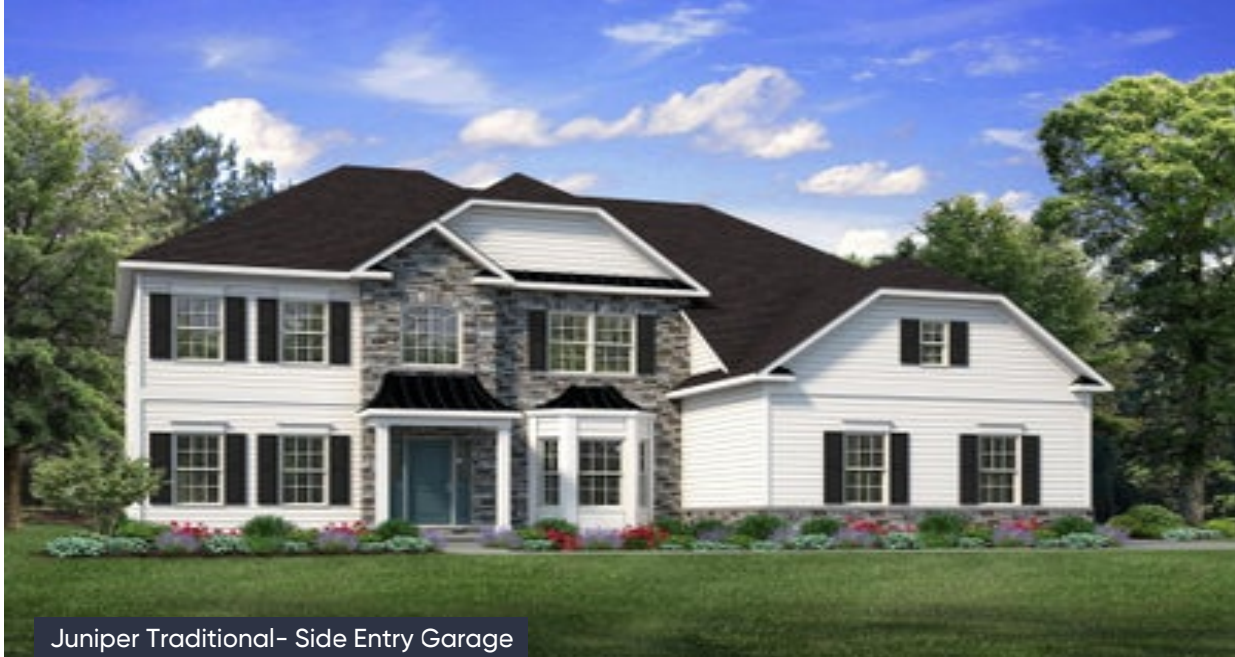
Juniper Traditional- Side Entry Garage

In The Estates at Steeplechase North from $799,900