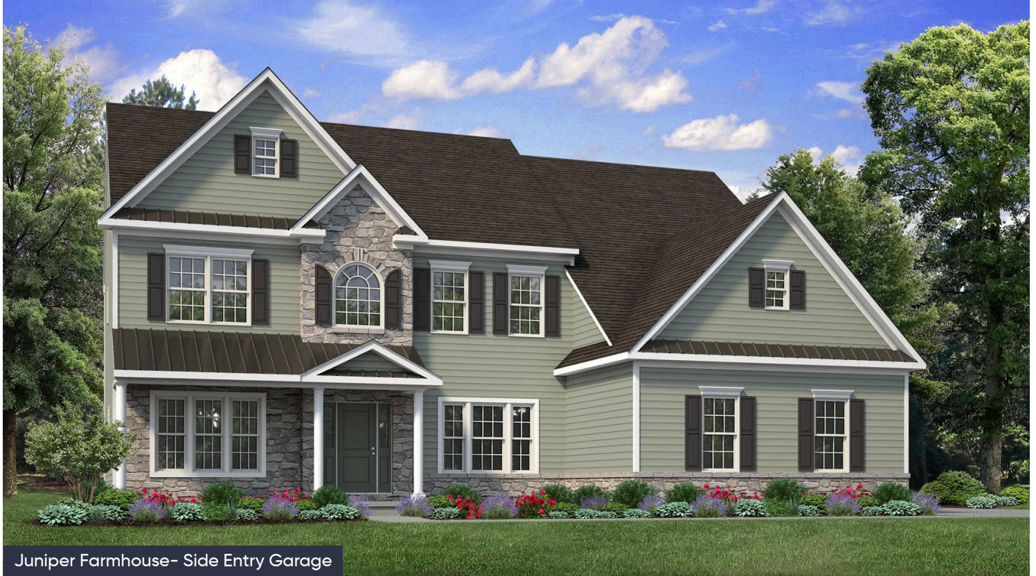
Juniper Farmhouse- Side Entry Garage

Elevate your lifestyle with the Juniper, offering the perfect balance of privacy and comfort for you and your family. An impressive two-story Foyer sets the tone for this home's spacious open-concept main living area. The Kitchen is a cook's dream, with an expanded island, a walk-in pantry, and a butler's pantry for serving drinks or snacks. The airy 2-story Great Room boasts a gas fireplace and plenty of windows for natural light. A private Study and Powder Room complete the 1st floor layout. Head up the open staircase to find an enormous Owner's Suite with sitting area, a walk-in closets, and private Owner's Bath. Additionally, a Guest Suite with its own Bath, two additional Bedrooms that share a Jack-n-Jill bath, and a convenient 2nd floor laundry room can also be found on the 2nd ... Read More at tuskeshomes.com