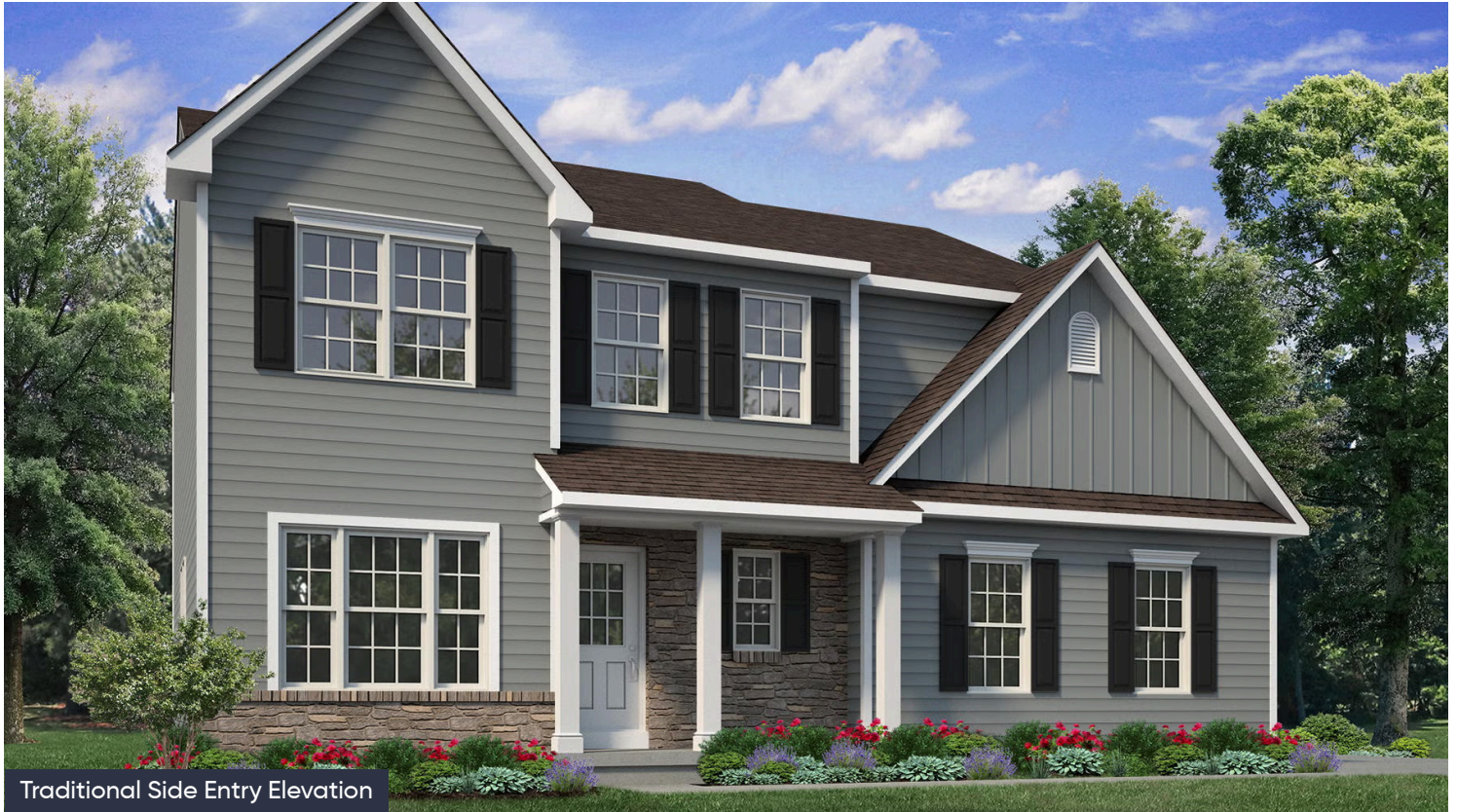
Traditional Side Entry Elevation

Welcome to the Madison, a charming and inviting home that's become one of our most popular floorplans. You'll feel right at home as soon as you step into its modern open-concept main living area. The seamless flow between the Dining Room, Kitchen with Nook, and Great Room creates a warm and welcoming atmosphere. The bright and sunny study with French doors and wall of windows is a perfect place to work or learn from home. The welcoming Foyer, convenient Powder Room, and practical Mudroom near the 2-car garage are just some of the lovely touches that make the Madison special. Upstairs, the Owner's Suite awaits with its spacious walk-in closet and private ensuite Bath. And with three additional Bedrooms, a full Bath, and a second-floor Laundry Room, there's plenty of space for everyone!Some ... Read More at tuskeshomes.com