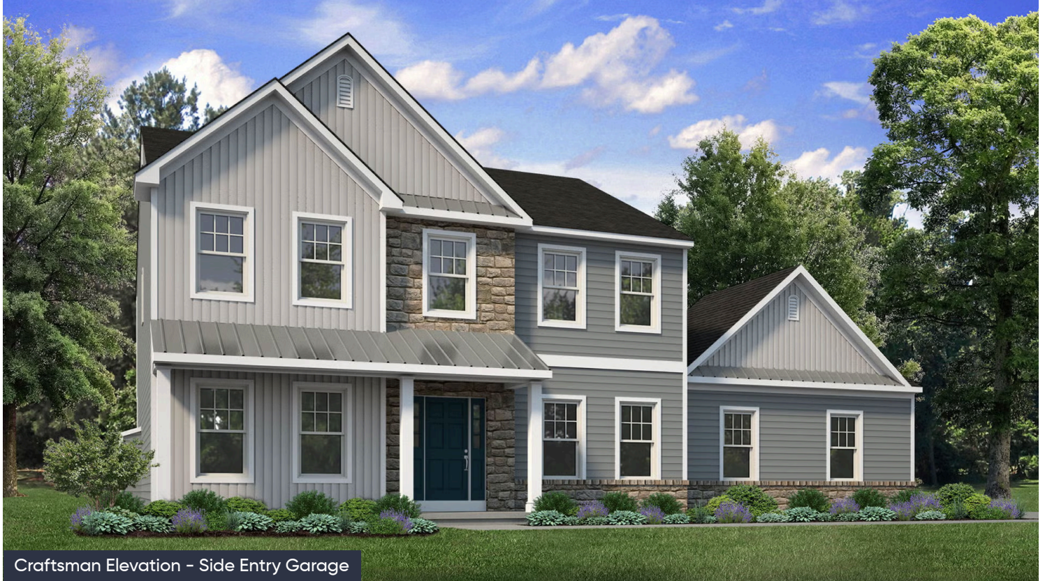
Craftsman Elevation - Side Entry Garage

Step into opulence with The Magnolia, a stunning floorplan starting at 2820 sq ft. The Kitchen boasts a large island with seating, granite or quartz countertops, and a dining Nook surrounded by windows. The main level also includes a spacious Great Room, formal Dining Room, Private Study with French doors, Powder Room, Mudroom, and welcoming Foyer. Upstairs, the Owner's Suite features double doors and 2 walk-in closets with an attached Owner's Bath. 3 additional bedrooms, a shared hall bath, and a 2nd floor Laundry Room complete the layout. For even more space, consider the optional Bonus Room above the Garage, perfect for a 5th Bedroom, second Home Office, or Play Room. Some images, videos, virtual tours shown may be from a previously built Tuskes home of similar design. Actual option ... Read More at tuskeshomes.com