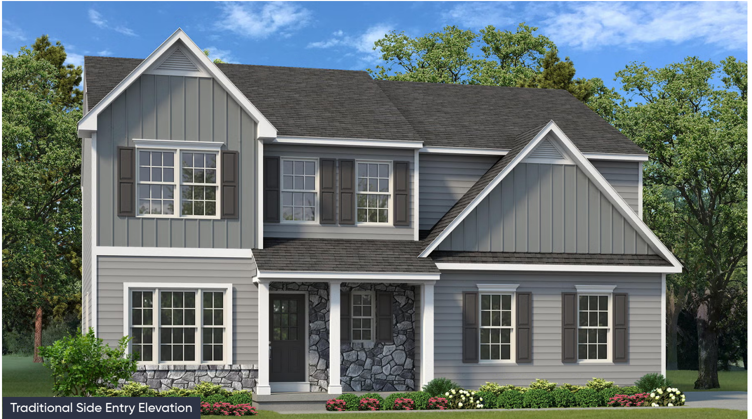
Traditional Side Entry Elevation

Designed with functionality in mind, the Morgan features a flowing, open-concept Kitchen, Dining Nook, and Great Room that are the heart of this home. As you enter through the 2 Car Garage, you'll find a Mudroom that's perfect for dropping off items like shoes, coats, or anything else you'd prefer to store. Just beyond, the expansive main living area awaits. Windows line the wall of the Great Room, and just beyond is a beautiful Kitchen that will please the pickiest of home chefs. A guest Foyer, Study, Dining Room/Flex Space, and Powder Room round out the first floor of this gorgeous home. Upstairs you'll find a large Owner's Suite with two walk-in closets and a private Owner's Bath that's perfect for getting away from it all. The remaining three Bedrooms all have their own walk-in closets ... Read More at tuskeshomes.com