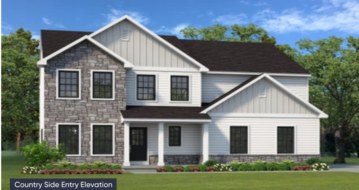
Country Side Entry Elevation

In The Estates at Steeplechase North from $689,900