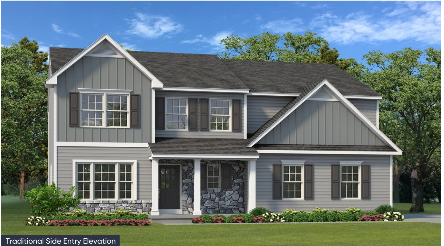
Traditional Side Entry Elevation

4 Beds 2.5 Baths 2,648 Sq Ft 2 Story 2 Car Garage