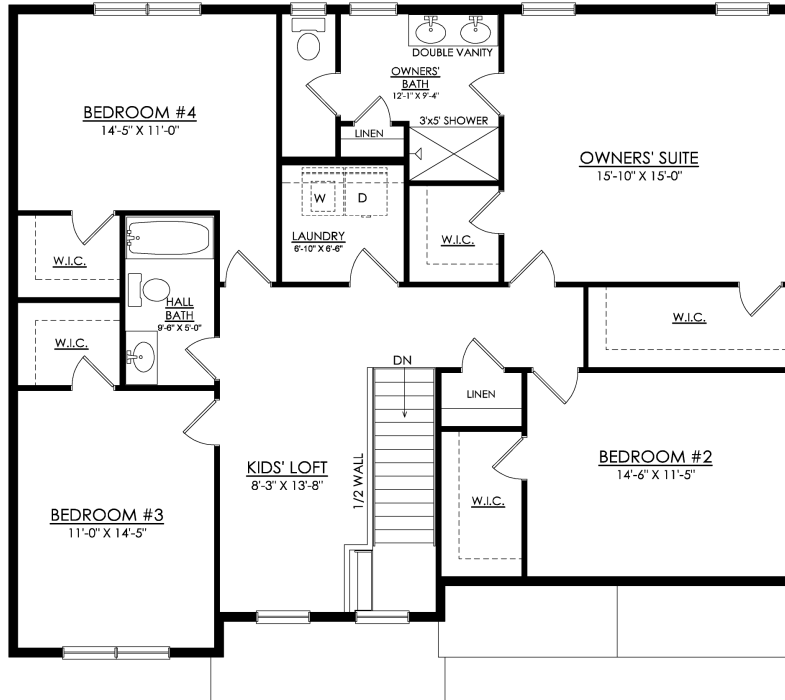
MORGAN TRADITIONAL STARTING AT 2648 SF

In The Estates at Steeplechase North from $689,900