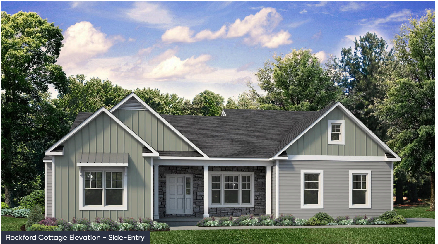
Rockford Cottage Elevation - Side-Entry

Introducing the Rockford, an inviting Ranch home designed for both comfort and style and offers a thoughtful layout that maximizes space and functionality. At the heart of the home, the open-concept design of the Great Room and Kitchen creates a welcoming atmosphere. With a grand cathedral ceiling and a wall of windows, there is a sense of openness so that no matter how many people visit, you will never feel cramped. The Owner's Suite tucked away in the back of the home includes two spacious Walk-In Closets, as well as its own ensuite bathroom for added privacy. The Rockford also features two additional Bedrooms that offer flexibility for guests, a home office, or other uses to suit your needs. With thoughtfully designed spaces and a layout that promotes flow and functionality, t ... Read More at tuskeshomes.com