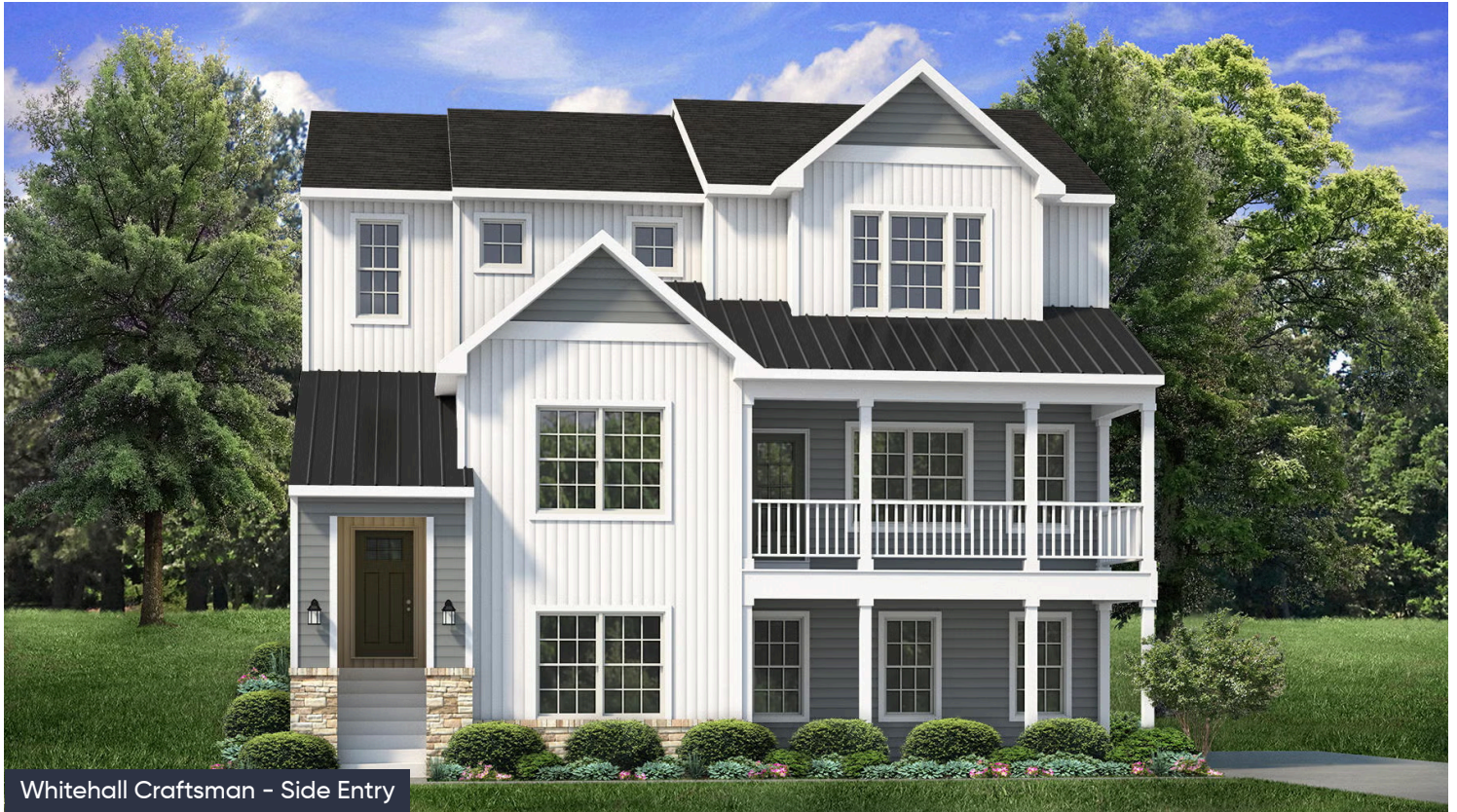
Whitehall Craftsman - Side Entry

Step into luxury with The Whitehall, an impressively designed home featuring a stylish and unique floorplan. As you enter through the convenient 2-Car Garage, you'll be greeted by the Family Foyer, a perfect space to keep your coats, shoes, and any other items out of sight. Take the stairs to the second floor and be awed by the spacious Entry, Guest Foyer, and Great Room with stunning views of the covered front porch. The Great Room seamlessly flows into the chic Kitchen, equipped with stainless steel appliances, granite or quartz countertops, a corner pantry, and a large kitchen island with an undermount sink and an overhang for seating. Entertain in style with a grand Dining Room or work from home in the private Study. A conveniently located Powder Room can also be found in the main livin ... Read More at tuskeshomes.com