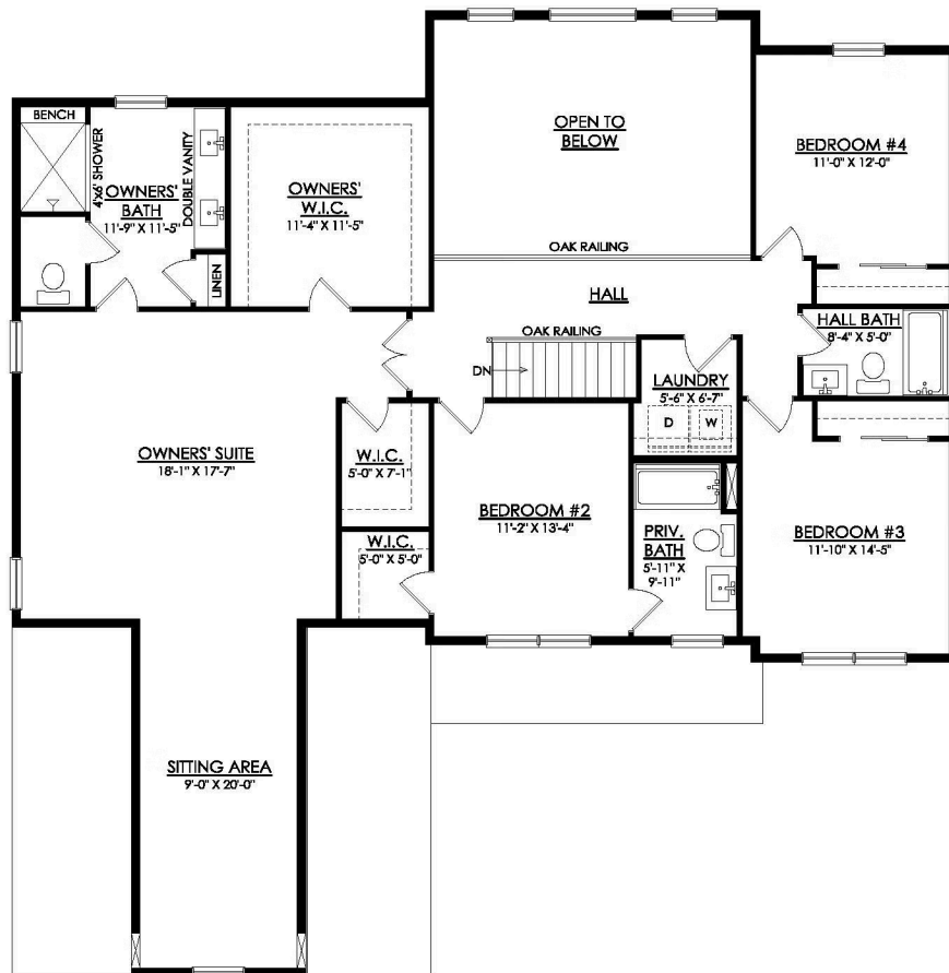
BRECKENRIDGE GRANDE FARMHOUSE 2ND FLOOR PLAN TC15