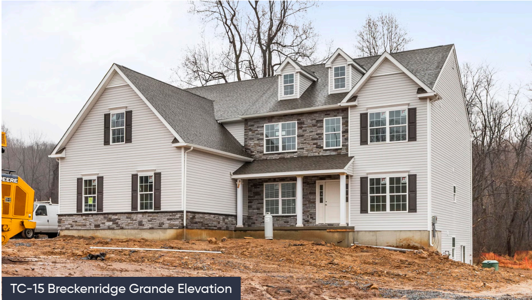
TC-15 Breckenridge Grande Elevation