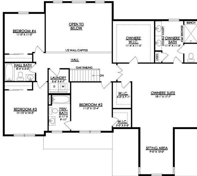
BRECKENRIDGE GRANDE FARMHOUSE 2ND FLOOR PLAN