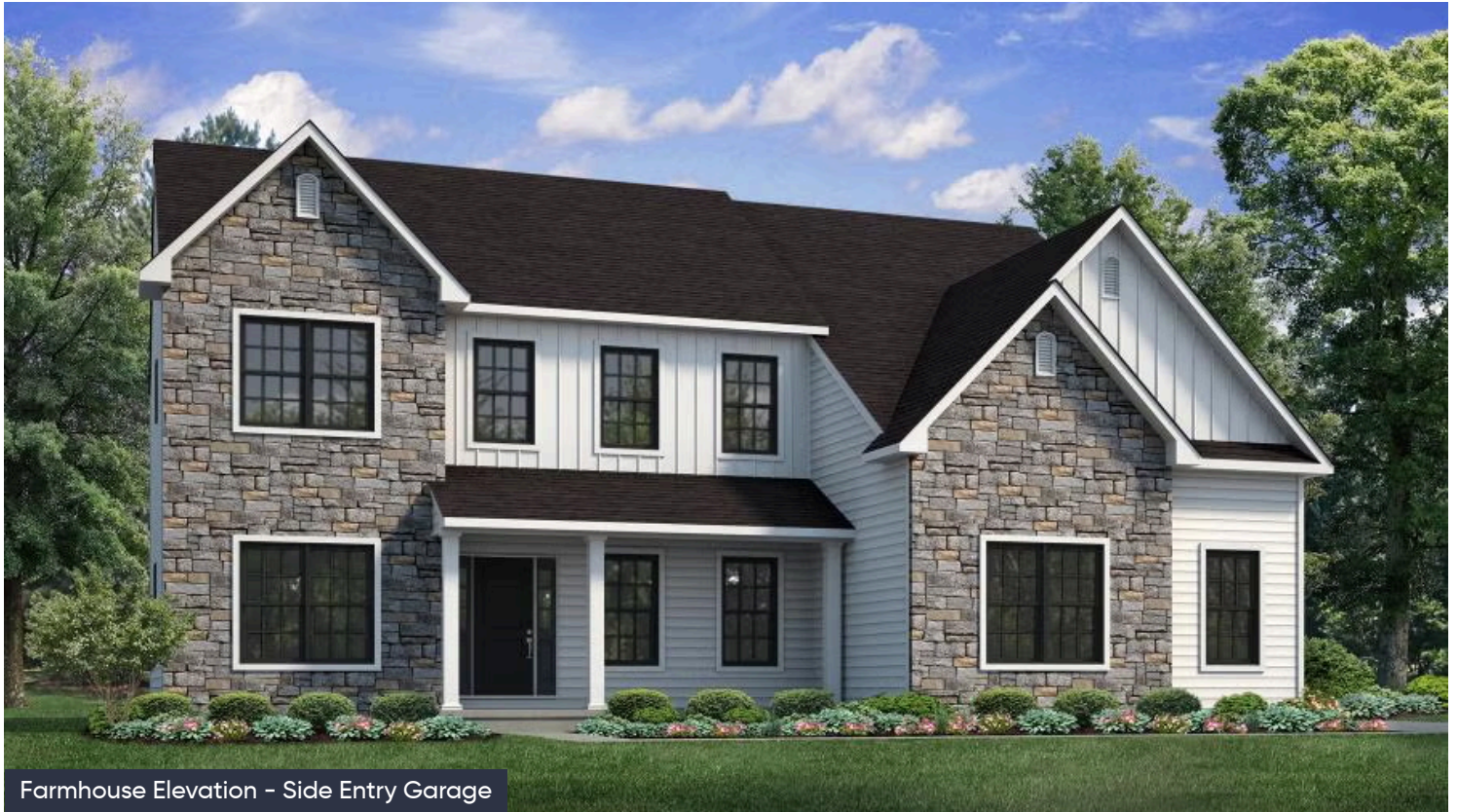
Farmhouse Elevation - Side Entry Garage

Discover the perfect family home in The Churchill! This beauty offers over 3000 sq ft of living space of elegance and comfort. The 2-story Great Room sets the tone of this open-concept floorplan, while the living room provides a warm and inviting space for gatherings. The gourmet Kitchen, complete with Dining Nook leading to the backyard, is a chef's dream with ample countertop space and a large island with room for seating. A formal dining room and study complete the main level. The second floor boasts a luxurious Owner's Suite with private Bath. Three additional Bedrooms, a shared hall Bath, and a conveniently located 2nd floor Laundry Room can also be found upstairs. Some images, videos, virtual tours shown may be from a previously built Tuskes home of similar design. Actual options ... Read More at tuskeshomes.com