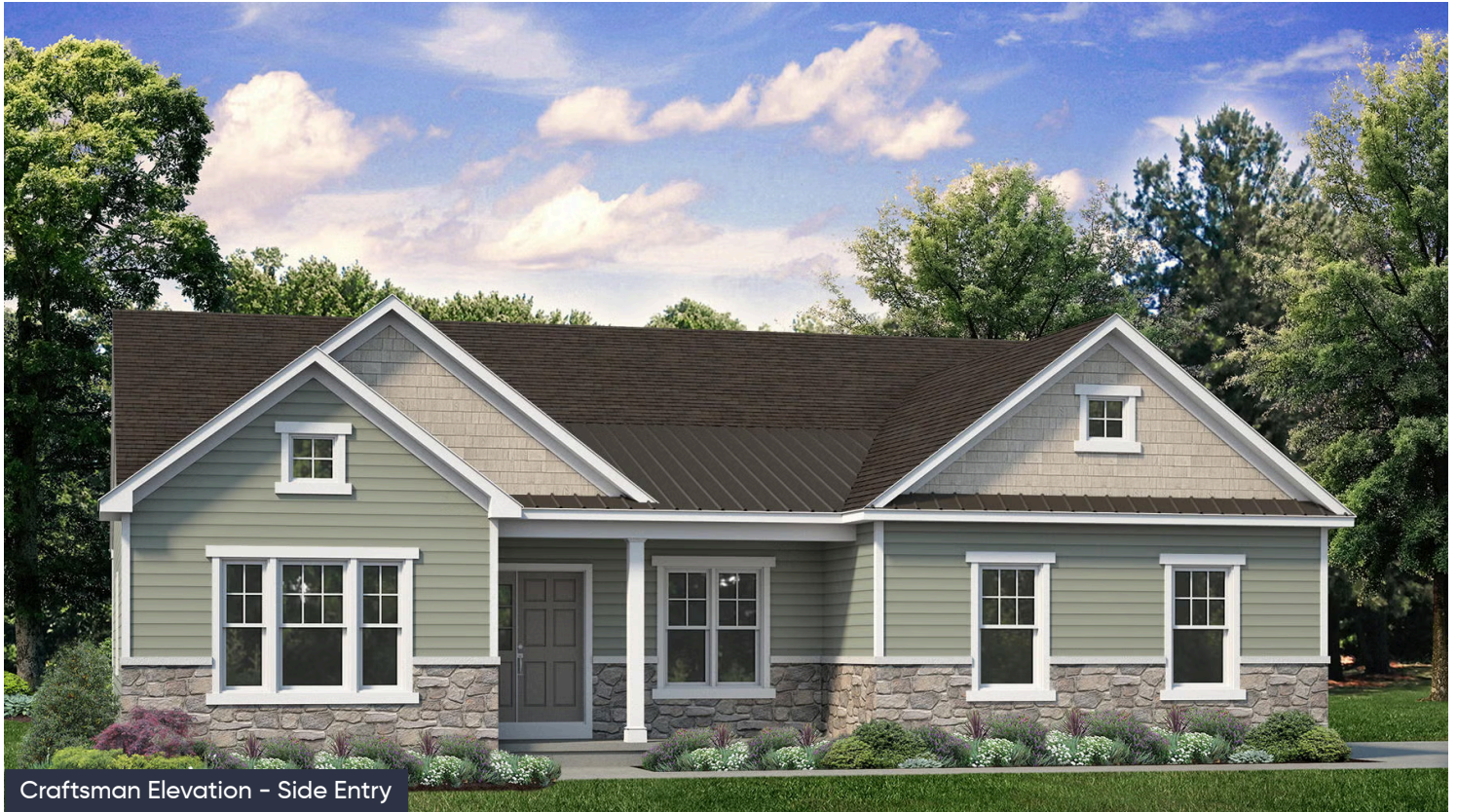
Craftsman Elevation - Side Entry

The Folino is an elegant ranch-style home with a well-planned design and alluring exterior. Step into the welcoming Foyer and continue to a private Study, two Bedrooms, and shared Hall Bath that set the tone for this sophisticated abode. The heart of this home is the open-concept Great Room, Kitchen, and Dining Room that making entertaining an effortless experience. The Kitchen boasts a large island with an overhang, offering ample seating for guests, a convenient corner pantry, and plenty of countertop space. The Great Room is bathed in natural light and leads to your backyard through a sliding door. Relax in style in your very own private haven as you enter the Owner's Suite, boasting a spacious walk-in closet and a luxurious ensuite Bath with a double vanity, linen closet, large shower, ... Read More at tuskeshomes.com