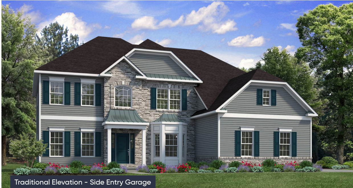
Traditional Elevation - Side Entry Garage