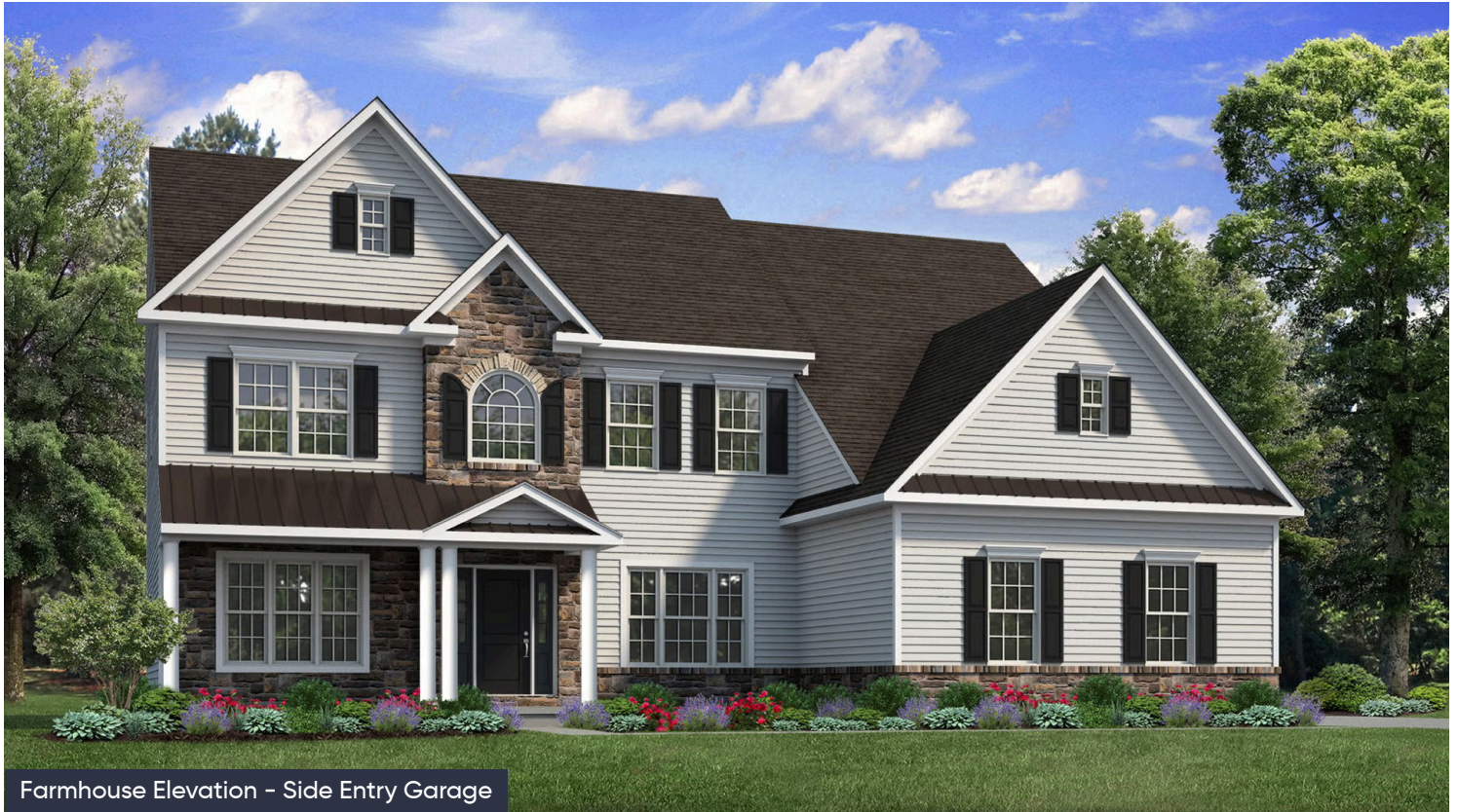
Farmhouse Elevation - Side Entry Garage

Elevate your lifestyle with the Juniper, offering the perfect balance of privacy and comfort for you and your family. An impressive two-story Foyer sets the tone for this home's spacious open-concept main living area. The Kitchen is a cook's dream, with an expanded island, a walk-in pantry, and a butler's pantry for serving drinks or snacks. The airy 2-story Great Room boasts a gas fireplace and plenty of windows for natural light. A private Study and Powder Room complete the 1st floor layout. Head up the open staircase to find an enormous Owner's Suite with sitting area, a walk-in closets, and private Owner's Bath. Additionally, a Guest Suite with its own Bath, two additional Bedrooms that share a Jack-n-Jill bath, and a convenient 2nd floor laundry room can also be found on the 2nd ... Read More at tuskeshomes.com