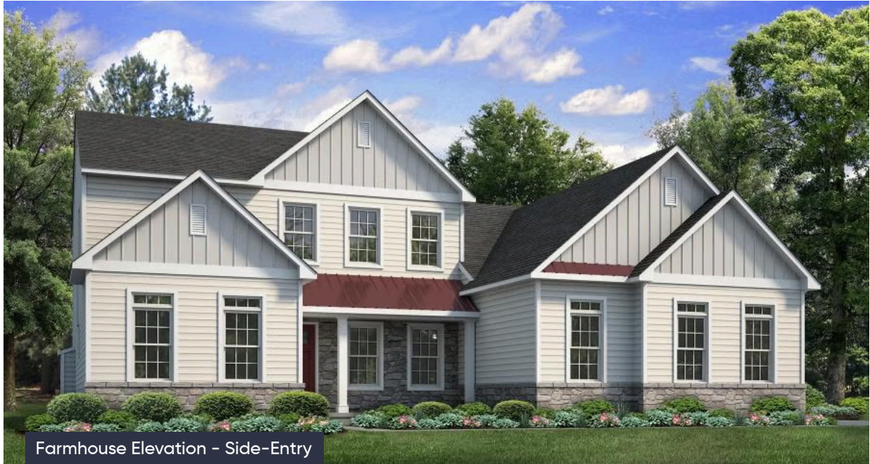
Farmhouse Elevation - Side-Entry