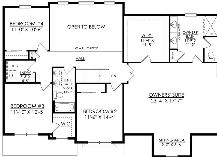
BRECKENRIDGE TRADITIONAL STARTING AT 2954 SF

In Hillcrest Estates at Mountain Top from $548,900