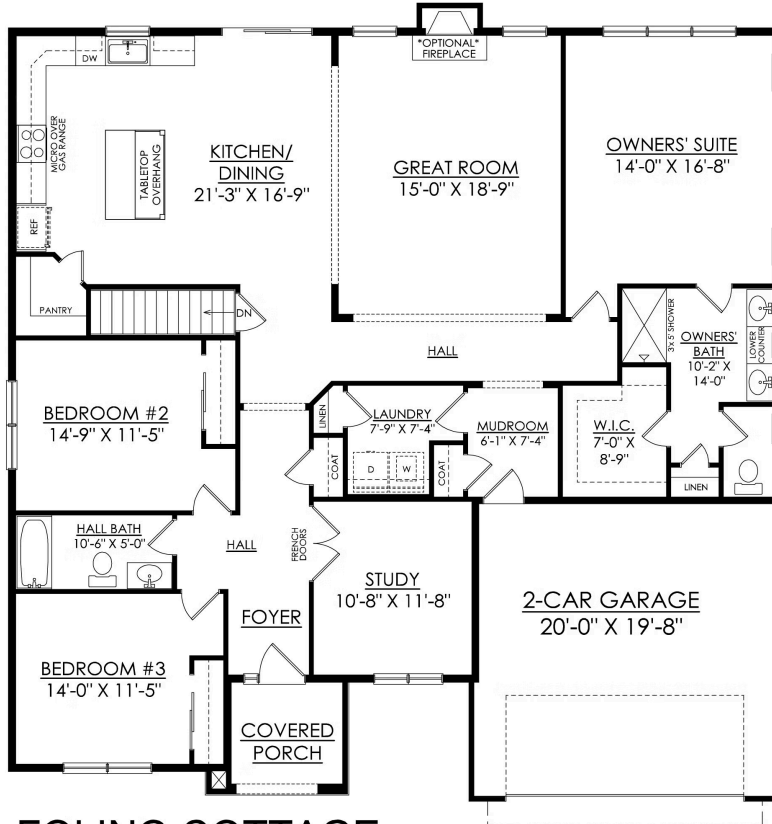
FOLINO COTTAGE STARTING AT 2134 SF

In Hillcrest Estates at Mountain Top from $475,900