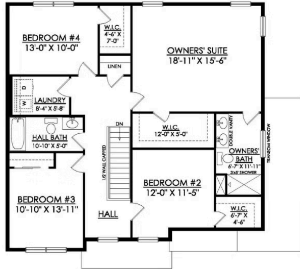
MADISON TRADITIONAL STARTING AT 2392 SF

In Hillcrest Estates at Mountain Top from $446,900