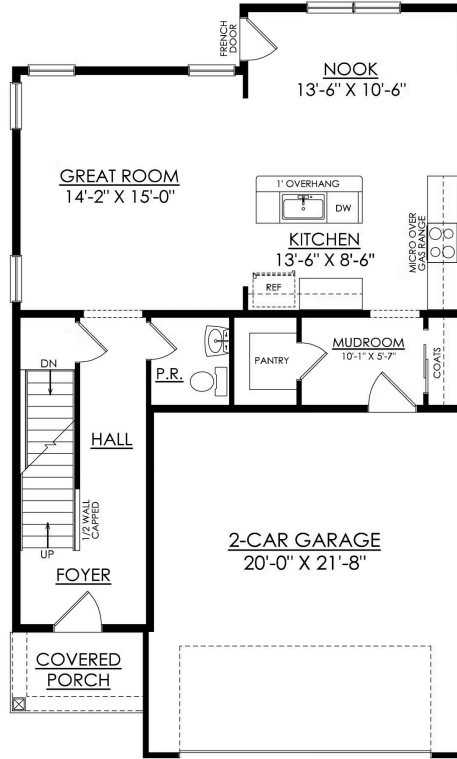
MIA 1ST FLOOR PLAN STARTING AT 1928 SF

In Hillcrest Estates at Mountain Top from $395,900