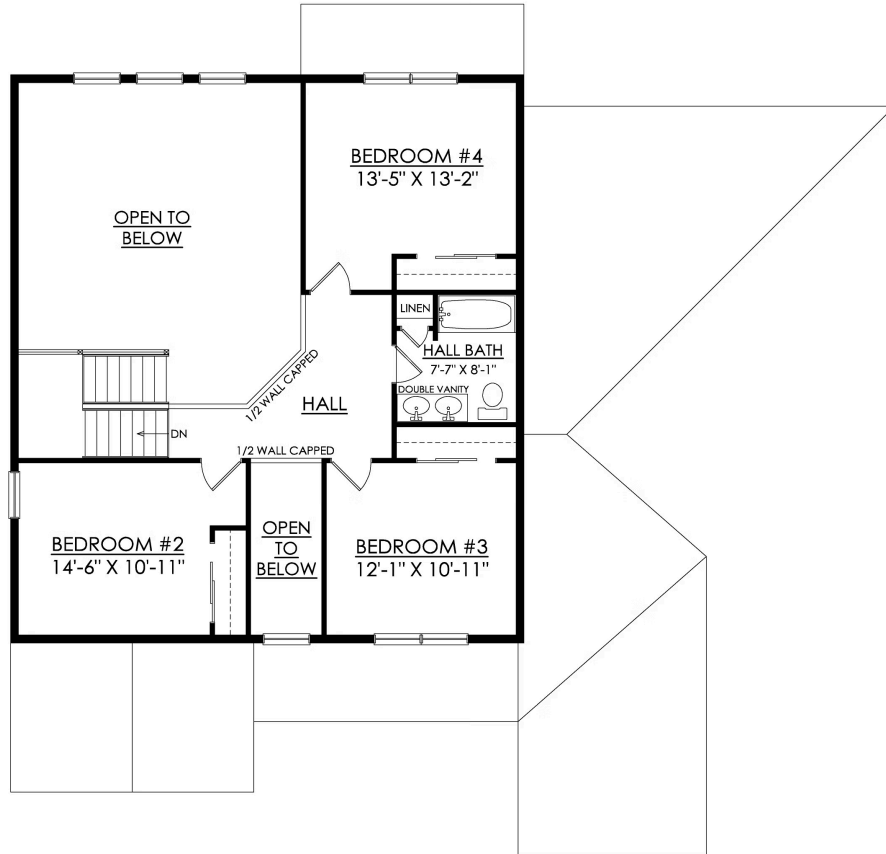
SIENNA COUNTRY STARTING AT 2828 SF

In Hillcrest Estates at Mountain Top from $558,900