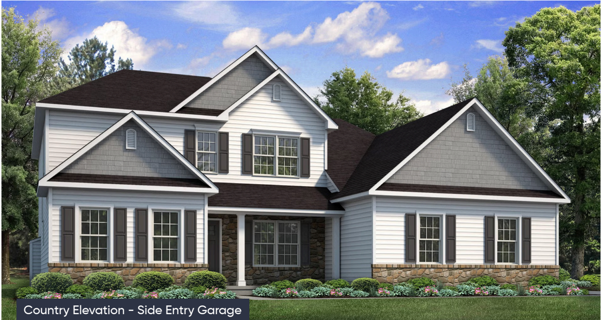
Country Elevation - Side Entry Garage

In Hillcrest Estates at Mountain Top from $563,900