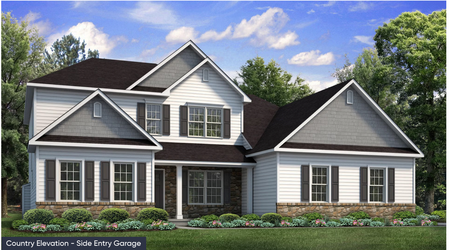
Country Elevation - Side Entry Garage

Live in luxury and style with the spacious Sienna, featuring an open-concept open living space that's designed for entertaining. The Kitchen boasts generous countertop space and a spacious island. Dine in elegance in the formal Dining Room or cozy Nook. The 2-story Great Room features a relaxing fireplace, making it the perfect spot to unwind or host family and friends. The private Study, separated by double doors, provides a quiet place to work or learn from home when needed. Step into the first-floor Owner's Suite, complete with a sitting area and a private bath retreat. On the second floor, there are three additional bedrooms and a shared hall bath for the family. For added flexibility, this plan also features an optional first-floor In-Law Suite, which relocates the Owner's suite upstairs. Read More at tuskeshomes.com