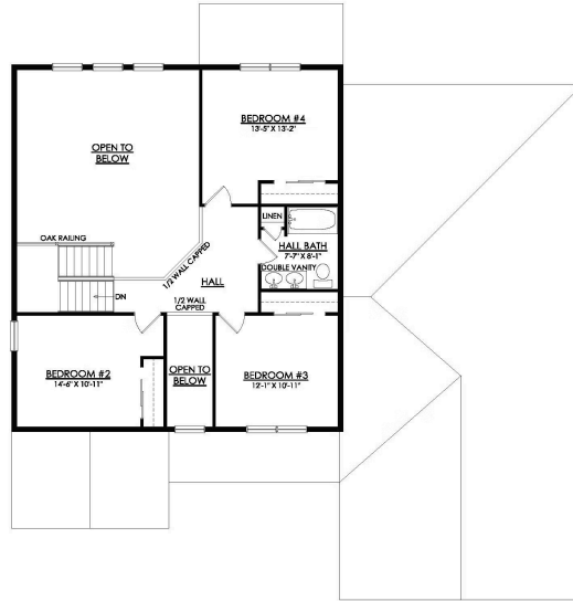
SIENNA COUNTRY OVERLOOK ESTATES STARTING AT 2880 SF