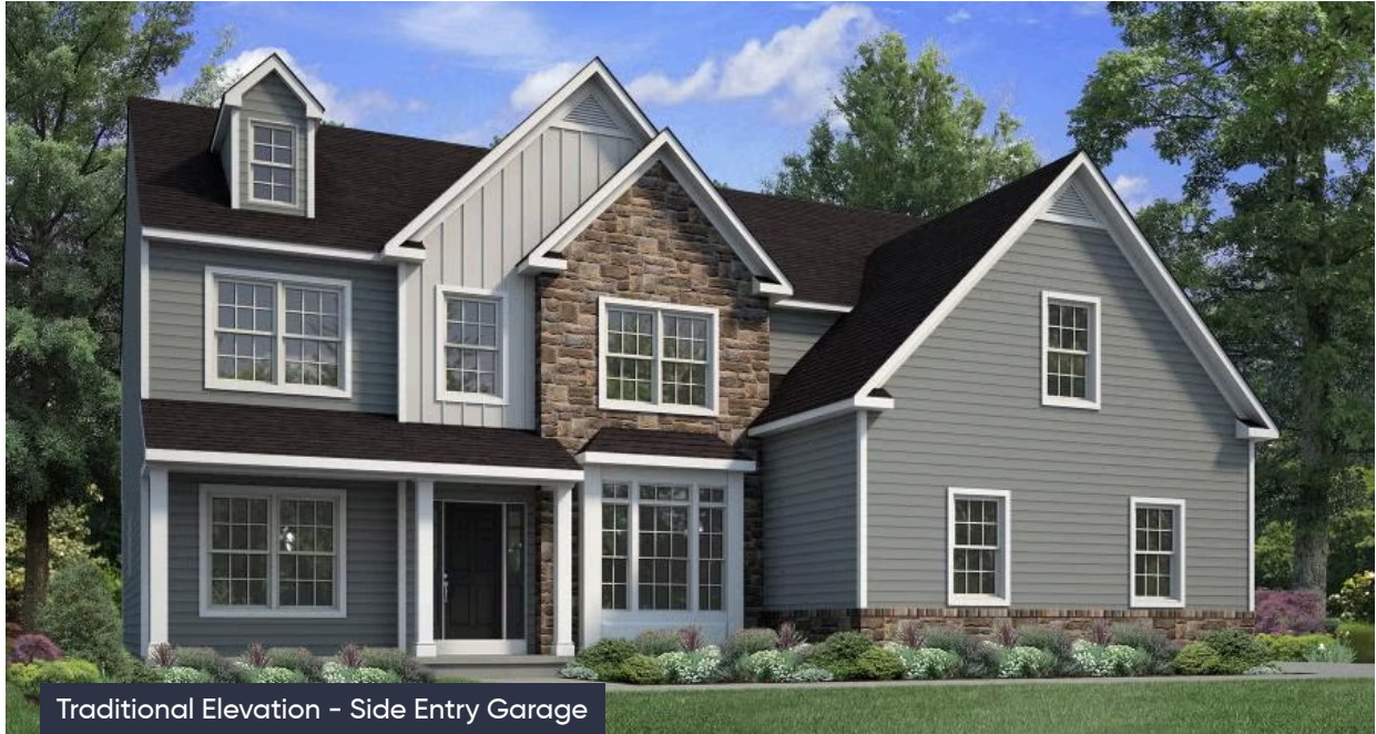
Traditional Elevation - Side Entry Garage

In Greenleaf Fields at Parkland from $804,900