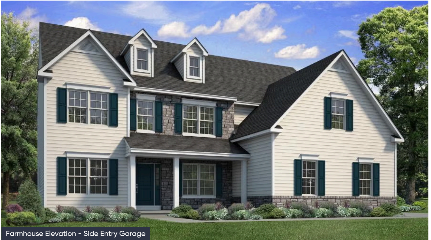
Farmhouse Elevation - Side Entry Garage

Experience luxury living the Breckenridge Grande, offering over 3000 sq ft of living space. Entertain in the stunning 2-story Great Room or relax in the nearby Living Room. The enormous kitchen features ample counter space and storage, with several configuration options to fit your lifestyle. The Dining Room is perfect for formal dinners while the Study offers a quiet place to work from home. The spacious Owner's Suite is located on the second floor and includes it's own Sitting Area and full Bathroom for ultimate privacy. An additional bedroom with an ensuite Bath is perfect for a guest suite or anyone in your family that needs a little more privacy. 2 more spacious bedrooms share a hall Bath, with a convenient 2nd floor Laundry Room nearby. Some images, videos, virtual tours shown ma ... Read More at tuskeshomes.com