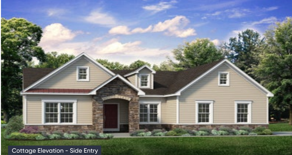
Cottage Elevation - Side Entry

In Greenleaf Fields at Parkland from $694,900