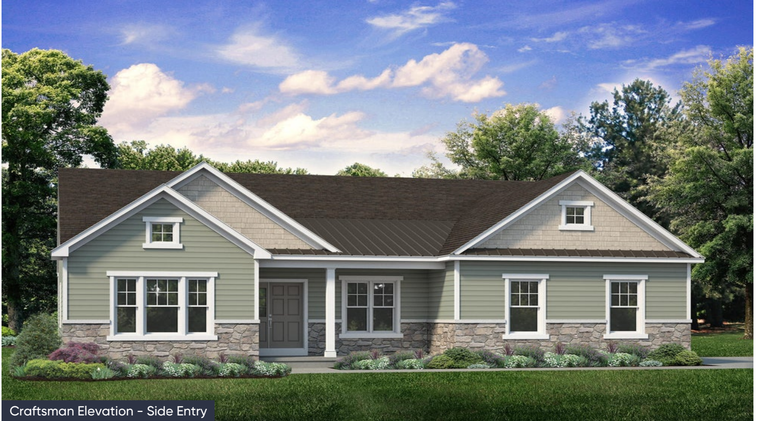
Craftsman Elevation – Side Entry

The Folino is an elegant ranch-style home with a well-planned design and alluring exterior. Step into the welcoming Foyer and continue to a private Study, two Bedrooms, and shared Hall Bath that set the tone for this sophisticated abode. The heart of this home is the open-concept Great Room, Kitchen, and Dining Room that making entertaining an effortless experience. The Kitchen boasts a large island with an overhang, offering ample seating for guests, a convenient corner pantry, and plenty of countertop space. The Great Room is bathed in natural light and leads to your backyard through a sliding door. Relax in style in your very own private haven as you enter the Owner's Suite, boasting a spacious walk-in closet and a luxurious ensuite Bath with a double vanity, linen closet, large shower, ... Read More at tuskeshomes.com