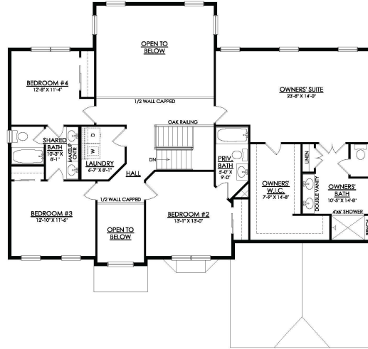
JUNIPER TRADITIONAL 2ND FLOOR PLAN

In Greenleaf Fields at Parkland from $834,900