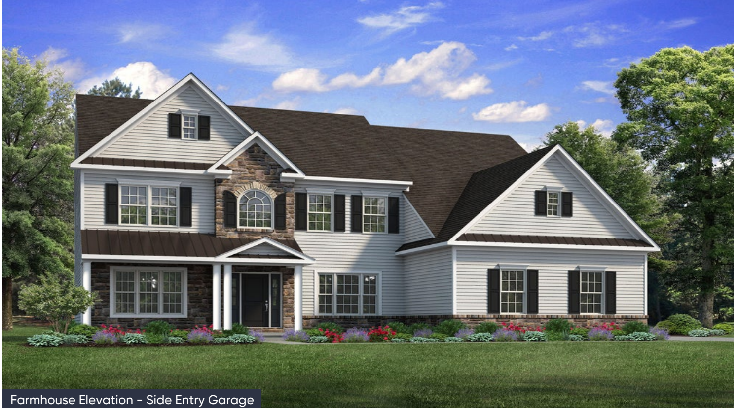
Farmhouse Elevation - Side Entry Garage

4 Beds 3.5 Baths 3,307 Sq Ft 2 Story 2 Car Garage