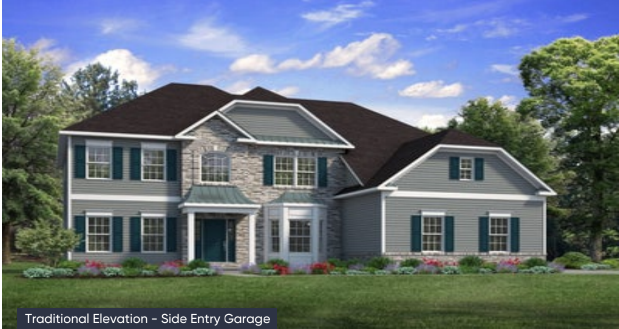
Traditional Elevation - Side Entry Garage

In Greenleaf Fields at Parkland from $834,900