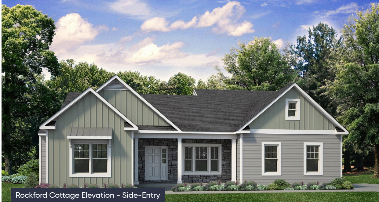
Rockford Cottage Elevation - Side-Entry

In Greenleaf Fields at Parkland from $724,900