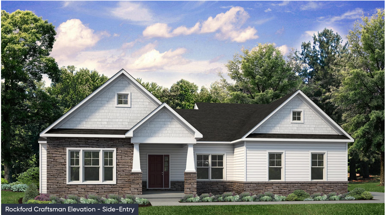
Rockford Craftsman Elevation - Side-Entry

Introducing the Rockford, an inviting Ranch home designed for both comfort and style and offers a thoughtful layout that maximizes space and functionality. At the heart of the home, the open-concept design of the Great Room and Kitchen creates a welcoming atmosphere. With a grand cathedral ceiling and a wall of windows along the Morning Room, there is a sense of openness so that no matter how many people visit, you will never feel cramped. The Owner's Suite tucked away in the back of the home includes two spacious Walk-In Closets, as well as its own ensuite bathroom for added privacy. The Rockford also features two additional Bedrooms that offer flexibility for guests, a home office, or other uses to suit your needs. With thoughtfully designed spaces and a layout that promotes fl... Read More at tuskeshomes.com