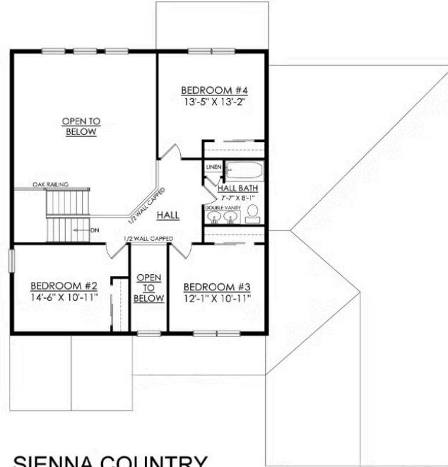
SIENNA COUNTRY STARTING AT 2828 SF

In Greenleaf Fields at Parkland from $774,900