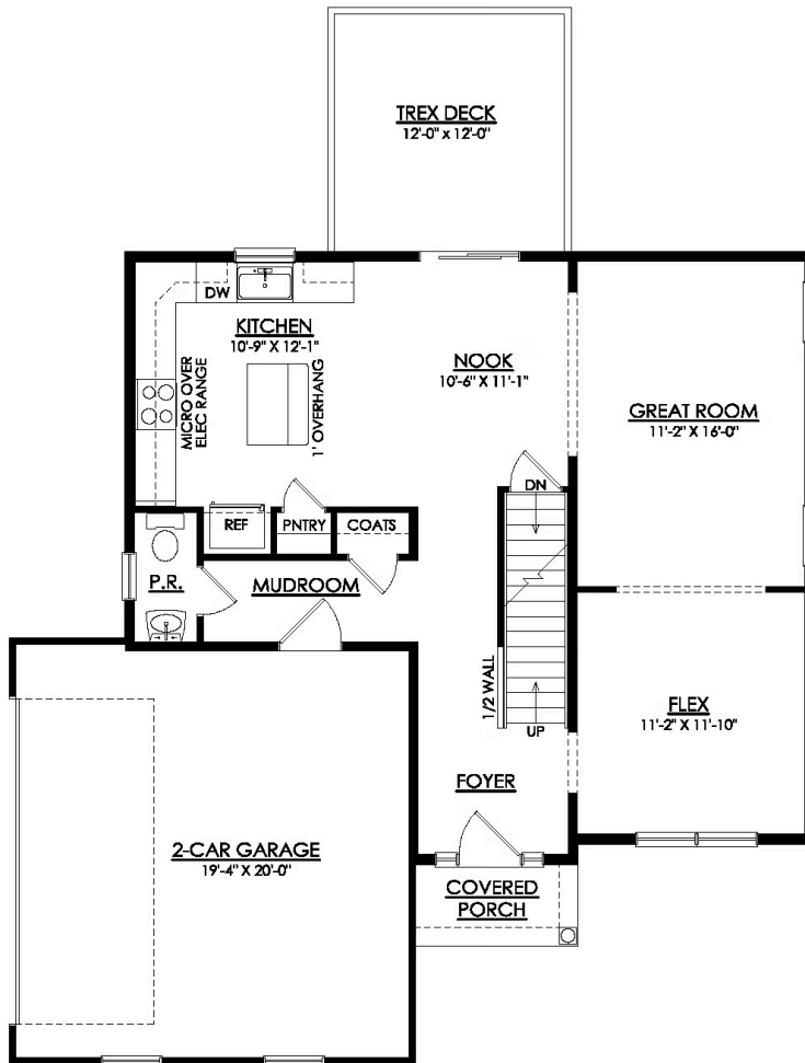
BIRCHWOOD 1ST FLOOR PLAN TF81